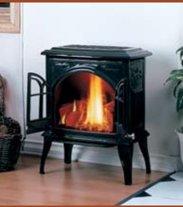
The cast iron freestanding Ascot with Diamond Black porcelain coating

Available in an assortment of beautiful porcelain finishes and manufactured from durable cast iron, the Ascot is the most powerful and efficient heater in its class.