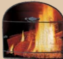
Clip-on fire screen